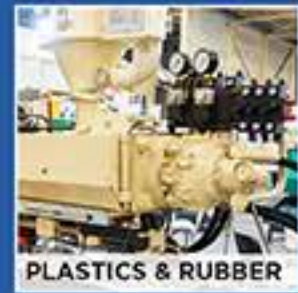
PLASTICS & RUBBER