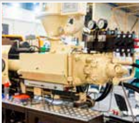
PLASTICS & RUBBER