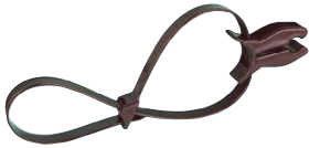
C20 - Pipe Mount w/ Poly Band Assembly List Price: $7.50