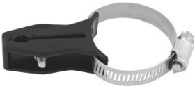
C31 - Pipe Mount w/ Stainless Band List Price: $8.50