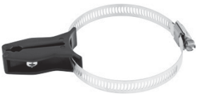
C30 - Pipe Mount w/ Stainless Band List Price: $8.50