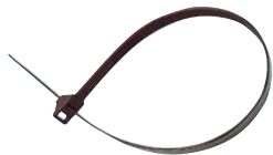
C40 - Releasable Tie List Price: $5.25