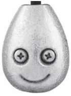
C10 - Zinc Plated Cord Weight List Price: $10.50