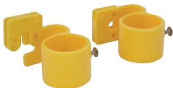
C70 - Pipe Mount Float Collar List Price: $8.50